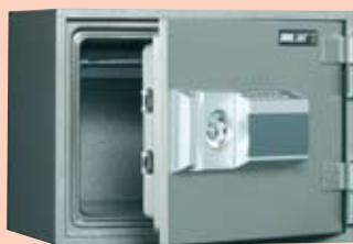
ESD 102K 7440/004