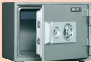
SD 103 7375/004