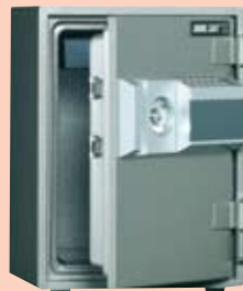
ESD 103TK 7525/004