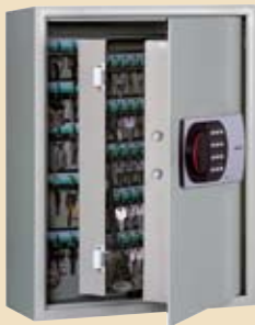
KC200 External 555h x 430w x 179d 26kg 7395/004