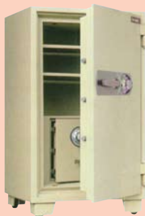
BS 106A 71890/004