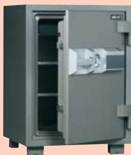
ESD 105 7995/004