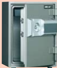
ESD 101TK 7399/004

All ESD series safes are powered by four AA batteries (alkaline recommended) which will last approx 12 months (subject to usage).