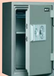
SD 103T 7375/004