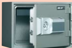
ESD 101K 7399/004