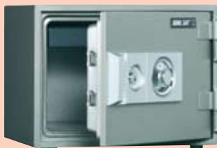
SD 102 7299/004