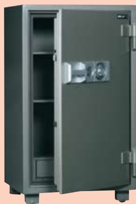
SD 106A 71210/004