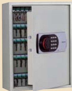
KC100 External 555h x 430w x 179d 23kg 7350/004

Completed with numbers hooks. Digital locking with slam shut latching to ensure the cabinet is always locked while not in use. Pre-drilled for wall mounting. Concealed hinges to resist hinge attacks. External 364h x 344w x 120d 11kg