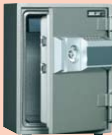
ESD 102TK 7440/004