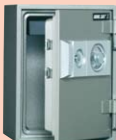
SD 101T 7247/004

SAFEGUARD fire-resistant safes are made from quality materials and products offering you maximum protection against fire. All SAFEGUARD fire safes are tested and approved by independent international organisations. SD series safes are key and combination locking with internal deadbolts on the hinge side to resist hinge attacks. Models from SD105 and up have changeable combination locks with independent relockers.