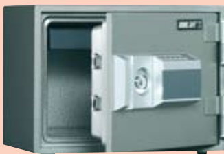
ESD 103K 7525/004