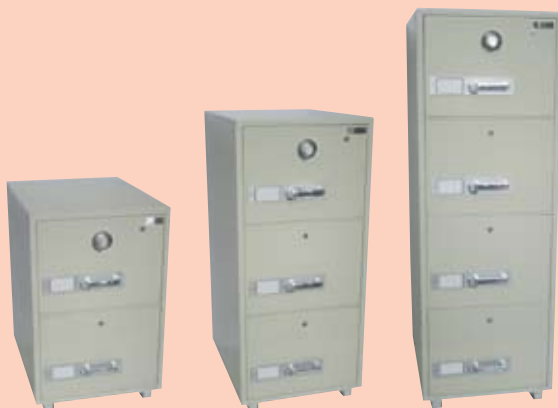
BF680-2 BF680-3 BF680-4

Fire-resistant filing cabinets are the ideal storage system for documents and other important files. Top drawer locks with key lock and combination for greater security. Each drawer can be individually locked with key lock. One hour fire-rated.