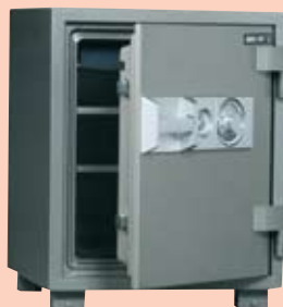
SD 105 7875/004